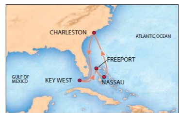
6 Day Key West & Bahamas Cruises 2010: 5/30, 6/5, 6/26, 7/24, 8/21, 9/18, 10/9, 11/9, & 12/11 2011: 1/1, 1/22, 2/12, 2/23, 3/6, 3/12, 4/2 & 4/23

2010 2011 Sunday, May 30- June 5 Saturday, January 1-7, 2011 Saturday, June 5-11 Saturday, January 22-28 Saturday, June 26-July 2 Saturday, February 12-18, 2011 Saturday, July 24-30 Wednesday, February 23-March 1 Saturday, August 21-27 Sunday, March 6-12 Saturday, September 18-24 Saturday, March 12-18 Saturday, October 9-15 Saturday, April 2-8 Tuesday, November 9-15 Saturday, July 23-29 Saturday, December 11-17 Saturday, October 22-28 Saturday, November 12-18 Saturday, December 3-9 Saturday, December 24-30