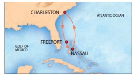
5 Day Bahamas Cruises May 18, 2010 - April 29, 2011

Friday, September 24-29 Wednesday, September 29-October 4 Monday, October 4-9 Friday, October 15-20 Wednesday, October 20-25 Monday, October 25-30 Saturday, October 30 - November 4 Thursday, November 4-9 Monday, November 15-20 Friday, December 17-22 Wednesday, December 22-27 Monday, December 27-January 1